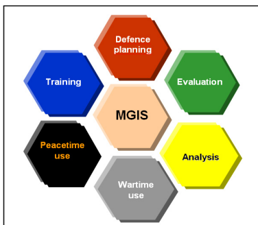
Figure 1. Fields of application of MGIS

According to the system plan the essential tasks of the MGIS is to support defence planning, preparation of the forces and staffs during implementation of defence tasks and, by the application of standard processes and products, to assure that the military organisations within the Hungarian Defence Forces have an appropriate knowledge base during operations executed in coalition composition.